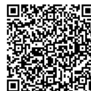
Zelle QR Code

Payments can be made via Zelle using bmdcsctreasurer@gmail.com or the QR code to the right PayPal using the QR code to the left, or the link on the website, or send a check.